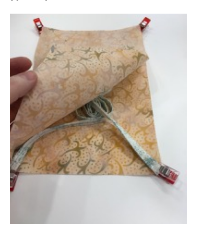
LAYER 2ND PIECE OF FABRIC ON TOP, ADD TO PINS/CLIPS THEN READY TO SEW.